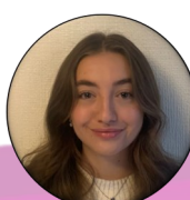
Miss Fireman PPT