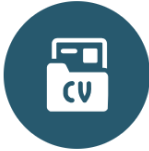
Applying for jobs