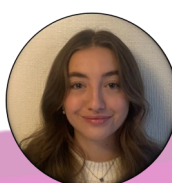
Miss Fireman PPT