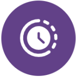
60 second interviews

As we approach the end of the academic year, we are asking Year 12 students to think about their next steps. Success at School will help you with researching potential future careers and to understand the different pathways. Whether you plan to go to university, or to seek an apprenticeship, the site has something for everyone!