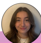
Miss Fireman PPT